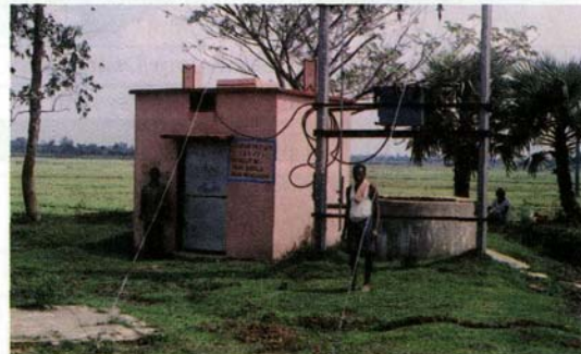
Jaipur-VIII L.I. Project at Tirtol (Maa Sarala Pani Panchayat)