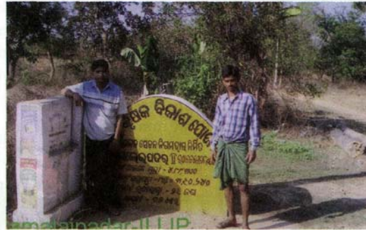
Samaleipadar-II LIP Barpali Block, (Jai Kishan Pani Panchayat)