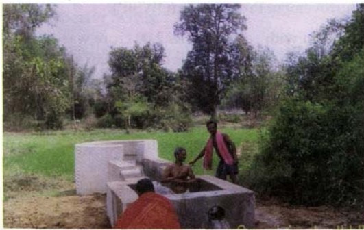
Samaleipadar-II LIP Barpali Block, (Jai Kishan Pani Panchayat)

O&M & Cost Recovery: The operation and maintenance of the Project shall be taken up by the Pani Panchayat, which will be free to collect appropriate user charges from the beneficiaries. The Government are not to collect any water rate from the farmers.